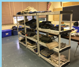
Much needed shelves were purchased thanks to a grant from Stewart's Holiday Match Foundation

Thanks to the generous donations of clothing and to the efforts of our volunteers, 300 local children have been provided with clothing care packages since the beginning of the 2016-2017 school year. As the school year comes to a close, we are still filling requests for children who do