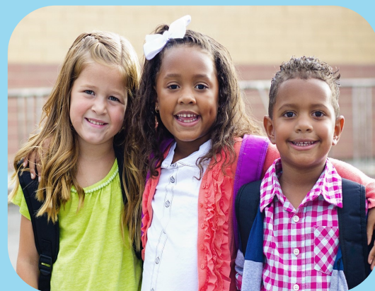
Back to School Smiling Faces

For more ways to donate to the Works of Mercy Initiative please read below.