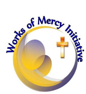
Schenectady Area Roman Catholic Churches