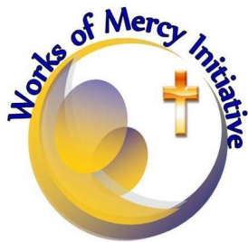
Schenectady Area Roman Catholic Churches